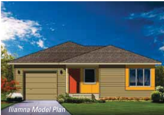
Iliamna Model Plan