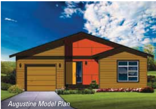
Augustine Model Plan

Come see the quality and details in our affordable new homes. Seeing is believing!